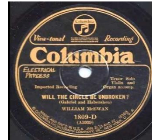
KEEP THE CIRCLE GOING

If you want to try the tune in the key of G, place your capo on the 3rd fret for a different sound.